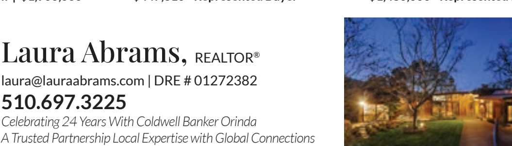
COMING SOON 341 Camino Sobrante, Orinda Call For Pricing and More Information