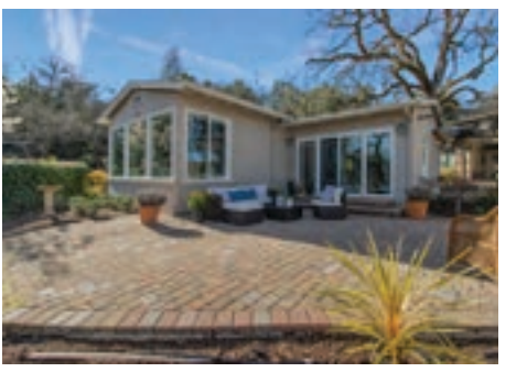
48 Camino Don Miguel, Orinda 48CaminoDonMiguel.com | $1,900,000