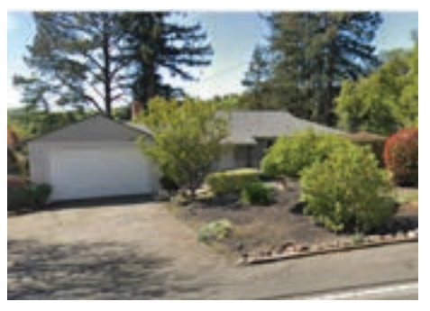
3279 Sweet Drive, Lafayette $1,480,000 - Represented Buyer