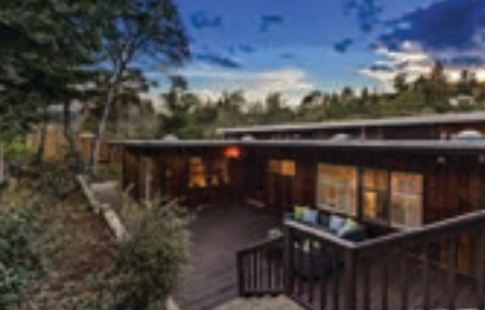
16 Evergreen Drive, Orinda 16Evergreen.com | $1,620,000