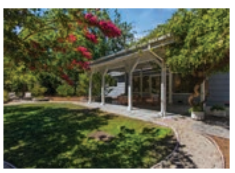
308 Rheem Boulevard, Moraga 308RheemBlvd.com | $1,745,000