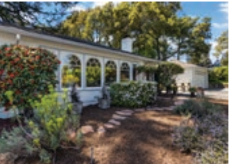
4 Mariposa Lane, Orinda 4MariposaLane.com | $1,570,000